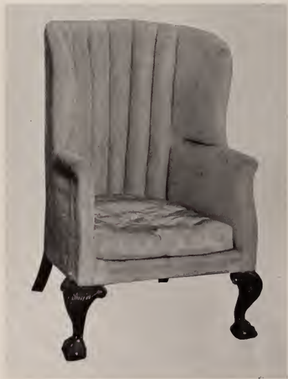
163—CHIPPENDALE CARVED MAHOGANY WING CHAIR

Kindly read the Conditions under which every item is offered and sold. They are printed in the forepart of the Catalogue.